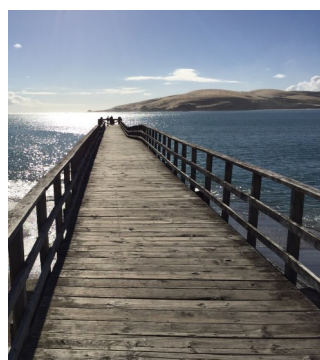
Building bridges into the future

We launched our new management training programmes in Christchurch and Auckland, including new courses in systems techniques, culture and strategy implementation which seemed to go down really well ( click for a full list of our courses).