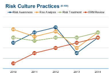
Embedment of risk culture practices timeline

development. Not only did the metrics provide this insight but they were also able to verify the feedback they were receiving from their culture development teams. For more information on the Culture Mapping Tool, contact us here .